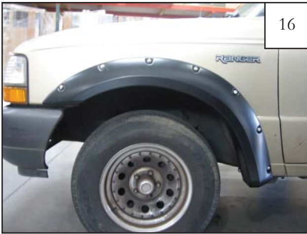
Completed front flare installation.