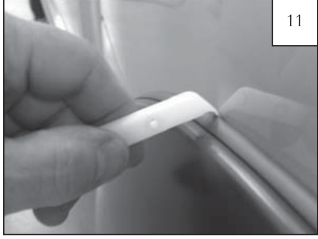
Using supplied Edge Trim Tool (ET1-0002), seat edge trim against vehicle by hooking curved end under edge trim at one end of flare. Next, slide around outer edge of flare to the other end.