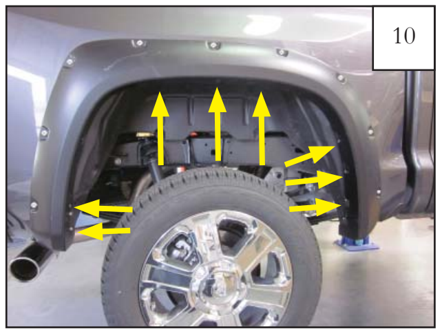
Ensure flare is properly positioned and tighten all screws. (See steps 6-8). Installation Complete