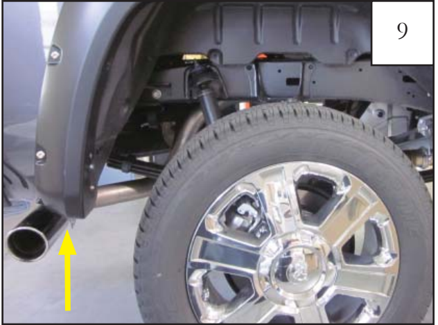
Install supplied Push Retainer (RV1-P009) into factory hole on underside of flare.