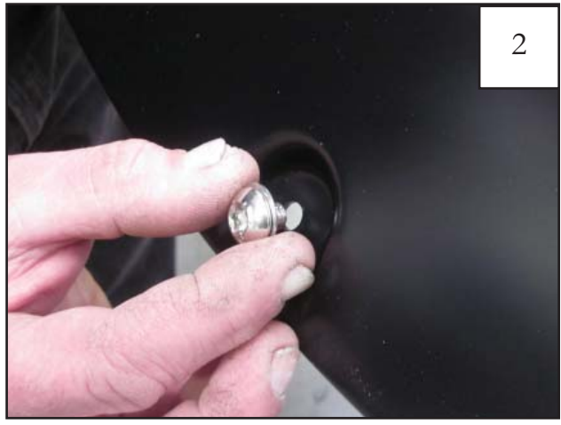
Put each Bolt/Washer combination through a pocket hole in the flare, Bolt head and Washer on the outside.