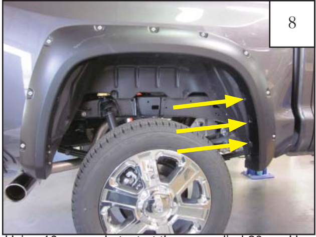
Using 10mm socket, start three supplied 20mm Hex Screws (SW1-0036)through the forward most holes of flare and into factory holes in fender.