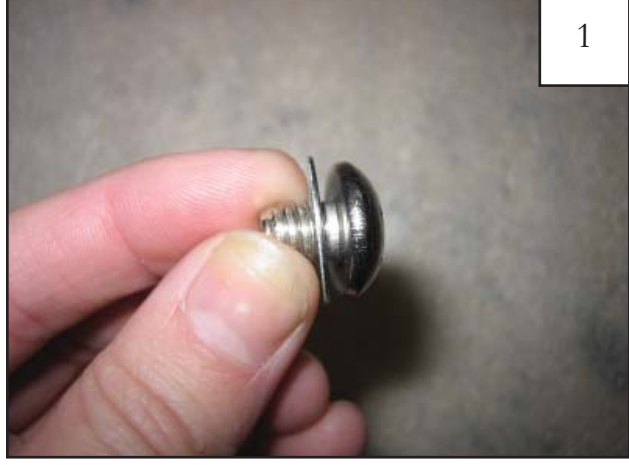
Put a Washer (WA1-0012) on each Bolt (SW1-0059).