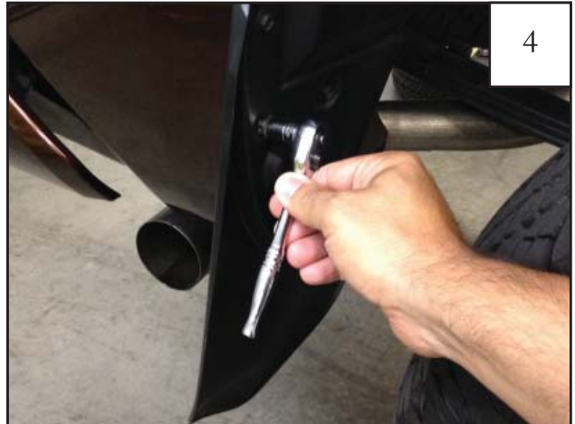
Using a socket wrench with a 10mm socket, factory screw second from the top of the mud guard.