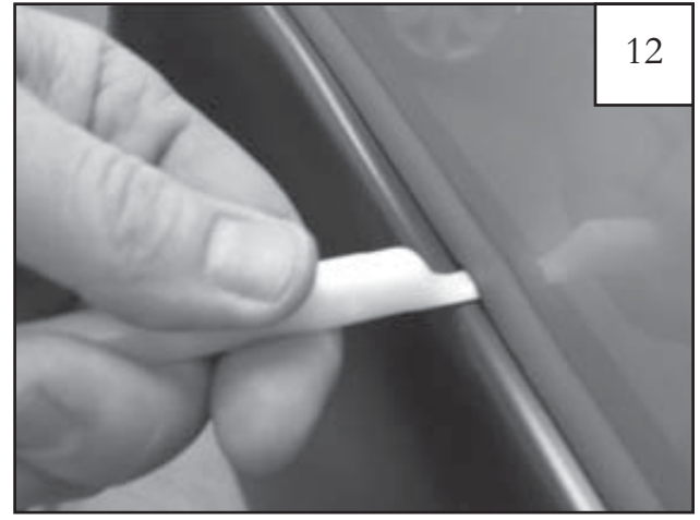
Using flat end of supplied Edge Trim Tool (ET1-0002), seat edge trim against flare by inserting straight end between edge trim and flare at one end. Next, slide around entire edge to the other end.