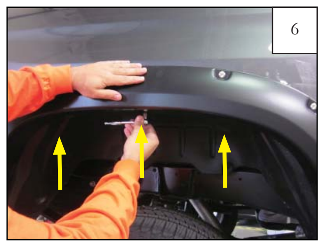
Hold the flare firmly on the fender. Start three supplied 20mm Hex Screws (SW1-0036) through the top center holes of the flare and into factory holes in fender.