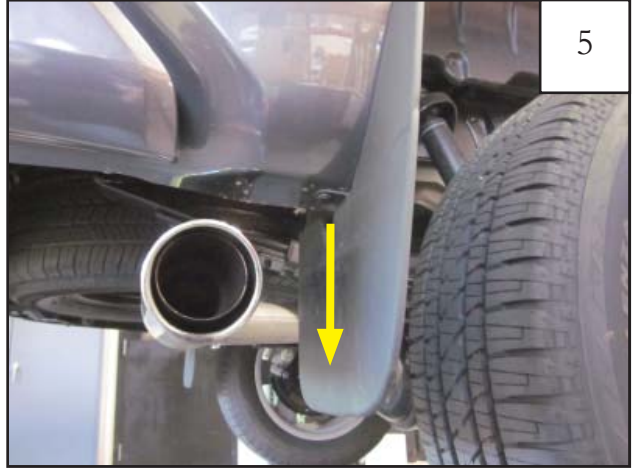
Remove push retainer from underside of factory mud guard and remove mud flap.