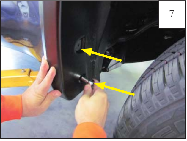
Start two supplied 20mm Hex Screws (SW1-0036) through the rearward most holes of flare and into the factory hole in fender.